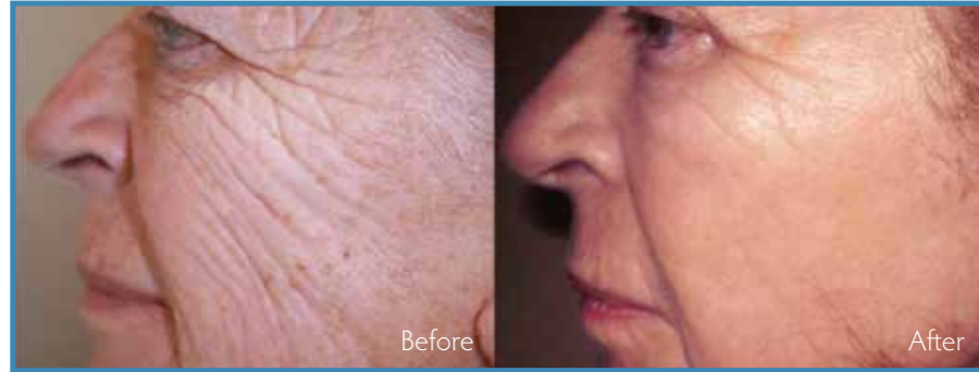
Best "Non-Surgical Facial Rejuvenation Enhancement" Winner THE Aesthetic Show 2011